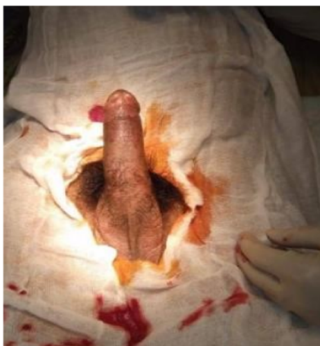
Fig. 2. The condition of the male genitalia after the Winter procedure.

postoperative treatment period. After being discharged, the patient returned for follow-up one month later. The patient complained of erectile dysfunction that had continued to the present.