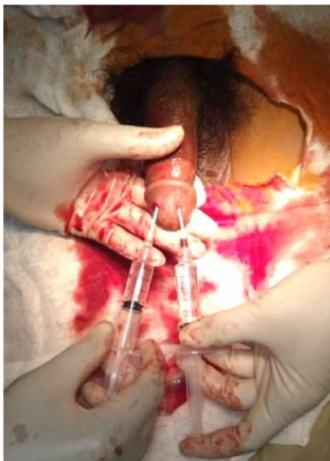
Fig. 1. Winter procedure for treating priapism.